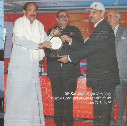
SKOCH Mega Project Award by Hon'ble Union Minister Shri Venkaih Naidu on 21.11.2014